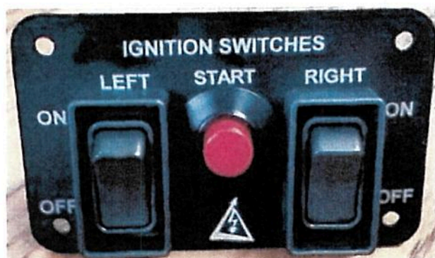
Figure 1: Option A, Horizontal Layout

The EA-15000 has two options that the installer/user can choose. Option A is a horizontal layout, and option B is a vertical layout. The installer/user of the EA-15000 will choose which option based on their own preference or what can fit onto the aircraft's instrument panel. Both options function in the same way.