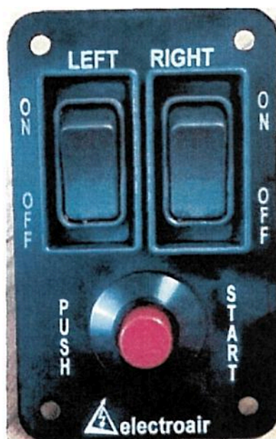
Figure 2: Option B, Vertical Layout