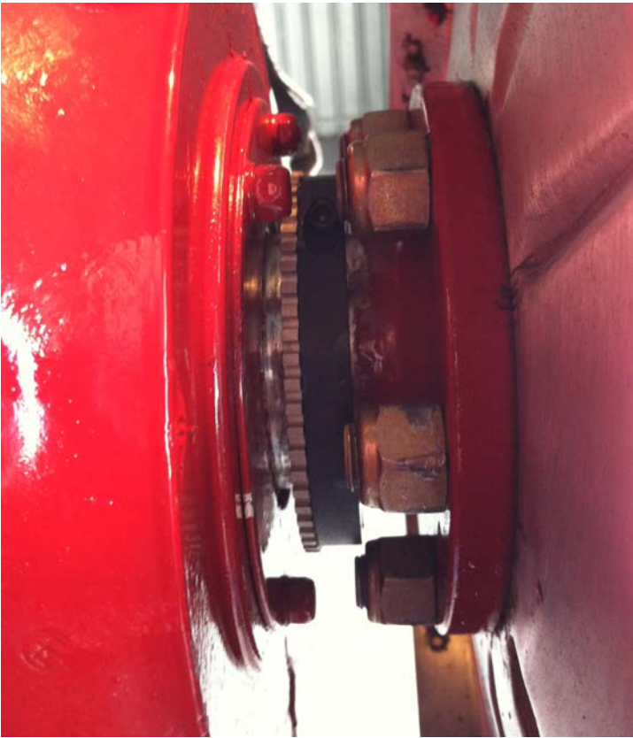
Figure 2: With CTSW Installed