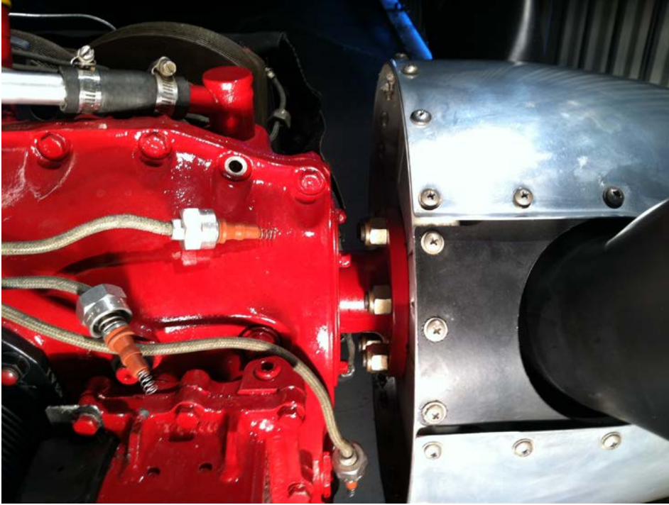
Figure 1: Prior to Installation